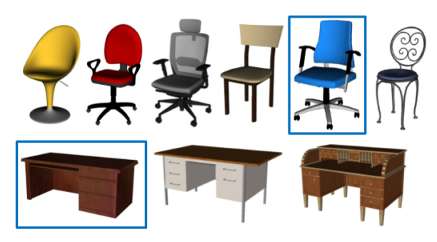
Figure 3: Select "a blue office chair" and "a wooden desk" from the models database

Scene Template Parsing We use the Stanford coreference system to determine when the same object is being referred to. To identify objects, we look for noun phrases and use the head word as the category, filtering with WordNet (Miller, 1995) to determine which objects are visualizable (under the physical object synset, excluding locations). To identify properties of the objects, we extract other adjectives and nouns in the noun phrase. We also match syntactic dependency patterns such as "X is made of Y" to extract more attributes and keywords. Finally, we use dependency patterns to extract spatial relations between objects.