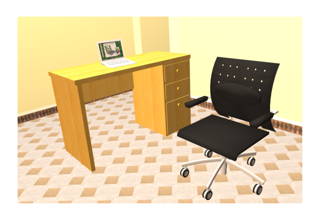
Figure 1: Generated scene for "There is a room with a chair and a computer." Note that the system infers the presence of a desk and that the computer should be supported by the desk.