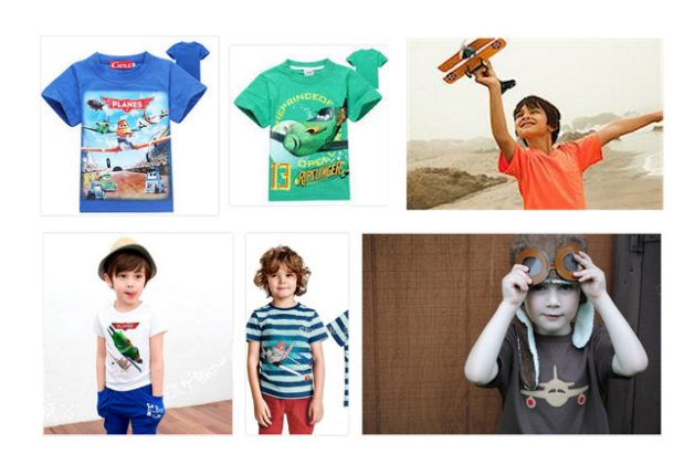
Figure 1: Actual results using a popular image search engine (top row) and ideal results (bottom row) for the query a boy wearing a t-shirt with a plane on it.

One of the big remaining challenges in image retrieval is to be able to search for very specific images. The continuously growing number of images that are available on the web gives users access to almost any picture they can imagine, but in order to find these images users have to be able to express what they are looking for in a detailed and efficient way. For example, if a user wants to find an image of a boy wearing a t-shirt with a plane on it , an image retrieval system has to understand that the image should contain a boy who is wearing a shirt and that on that shirt is a picture of a plane.