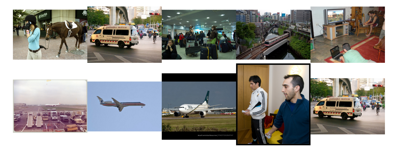
Figure 3: Top 5 results of the object only baseline (top row) and our classifier-based parser (bottom row) for the query "The white plane has one blue stripe and one red stripe". The object only system seems to be mainly concerned with finding images that contain two stripe objects at the expense of finding an actual plane. Our classifier-based parser also outputs the relation between the stripes and the plane and the colors of the stripes which helps the image retrieval system to return the correct results.