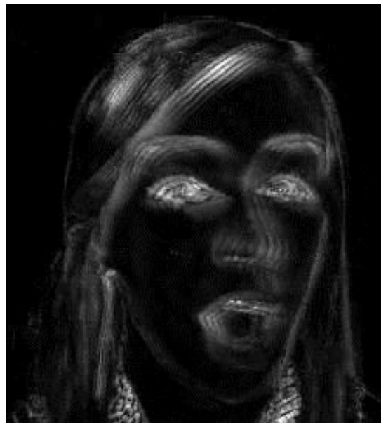
Figure 2: Five-frame composite visualization of the speaker’s head and facial movements as captured by movement amplitude across the first peak shown in Figure 1.

In processing our data we also convert MA measurements to z-scores per speaker to allow for comparable measurements in spite of differences across recording conditions such as speaker distance from the camera, color of the background and speaker clothing, and so on. As with our acoustic variables, for each video we extract an MA maximum, mean, minimum, and standard deviation for each PBU.