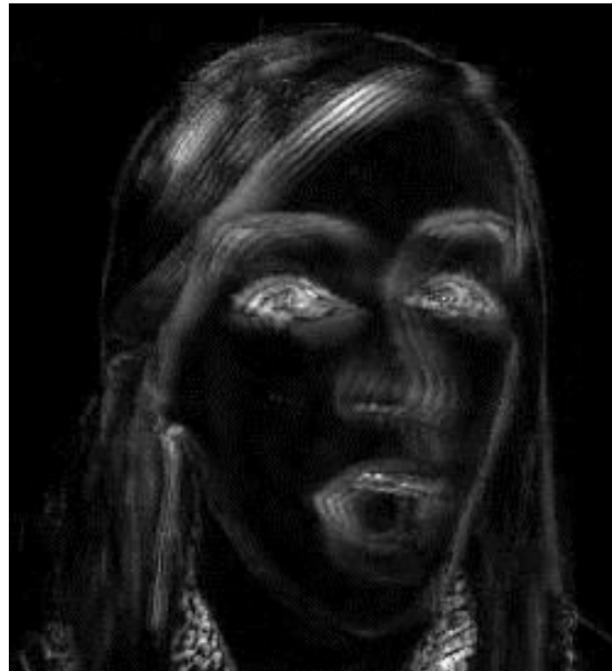
Figure 2: Five-frame composite visualization of the speaker’s head and facial movements as captured by movement amplitude across the first peak shown in Figure 1.

In processing our data we also convert MA measurements to z-scores per speaker to allow for comparable measurements in spite of differences across recording conditions such as speaker distance from the camera, color of the background and speaker clothing, and so on. As with our acoustic variables, for each video we extract an MA maximum, mean, minimum, and standard deviation for each PBU.